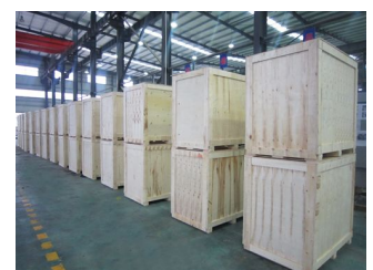
Every Generator Comes Well Packed